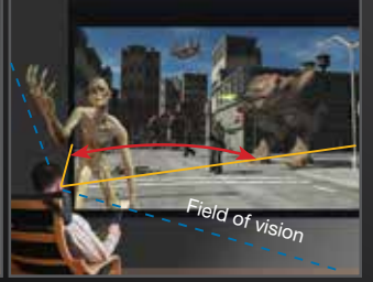
50" Optoma Projector